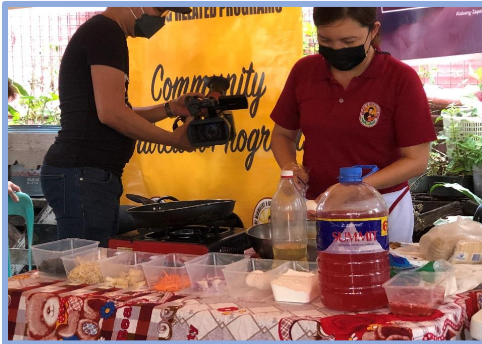
Dr. Infante explained the different ingredients and the Appropriate measure of the vegetable menu.