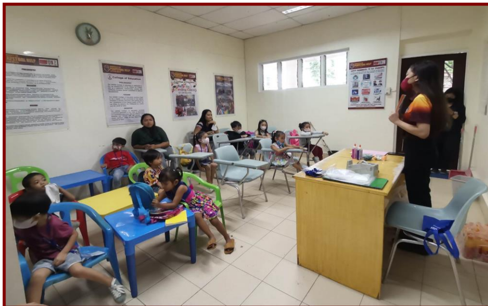
Ms. Capital showed the children the materials to be used in making the scrapbook.