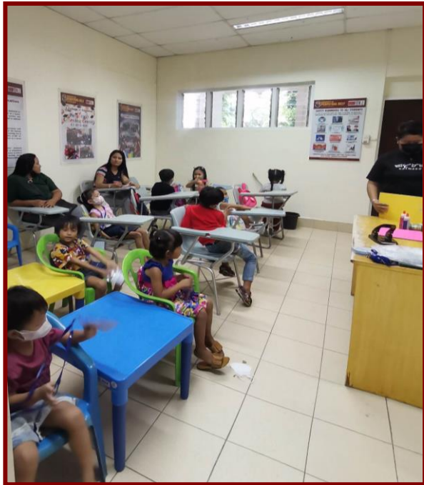
The children were patiently waited for their teacher.