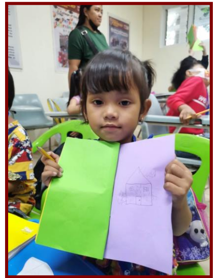
The kids show off their finished drawing.