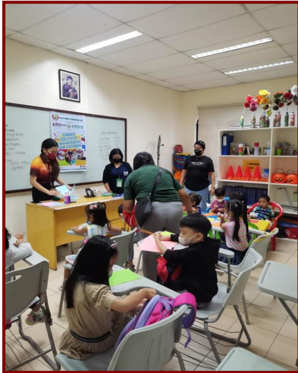
The children were given materials for their activity.