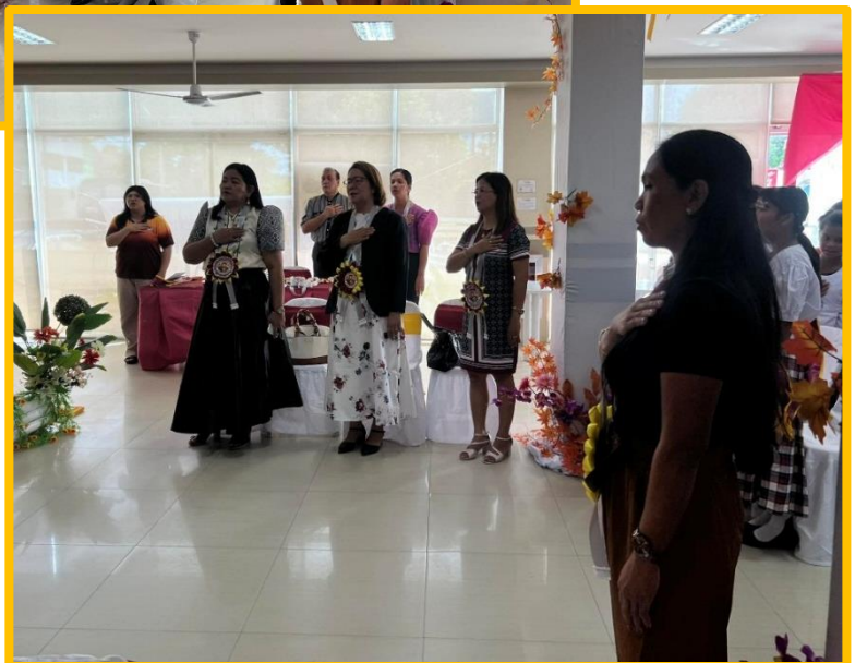
Singing the National Anthem