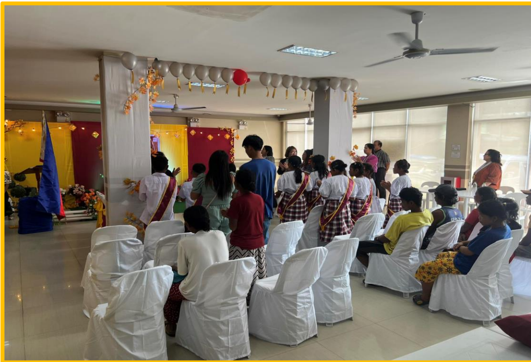
Singing of the Mimoropa March Occidental Mindoro March